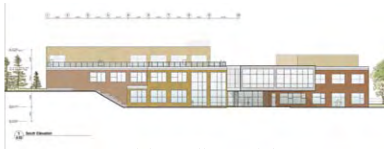
South Elevation - Building Concept Sketch