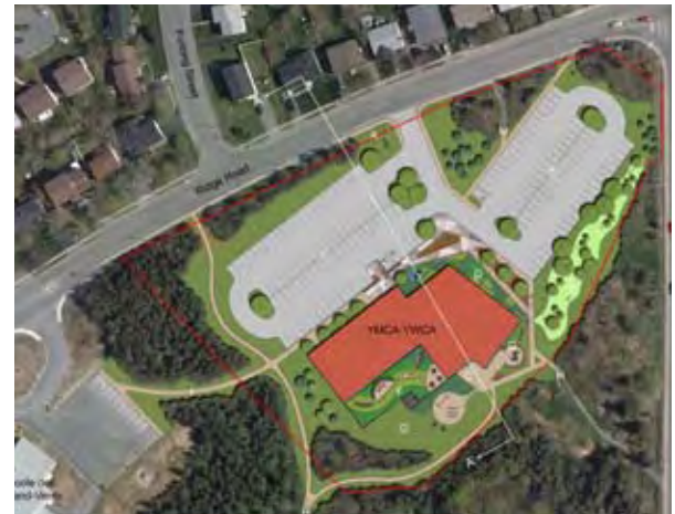
Concept site plan - new St. John's Family Y Ridge Road and Higgins Line.