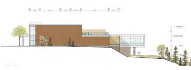
West Elevation - Building Concept Sketch