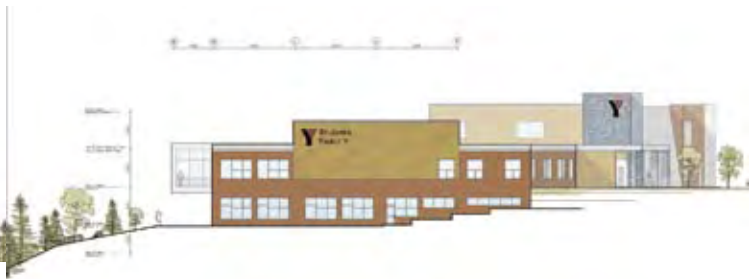
East Elevation - Building Concept Sketch