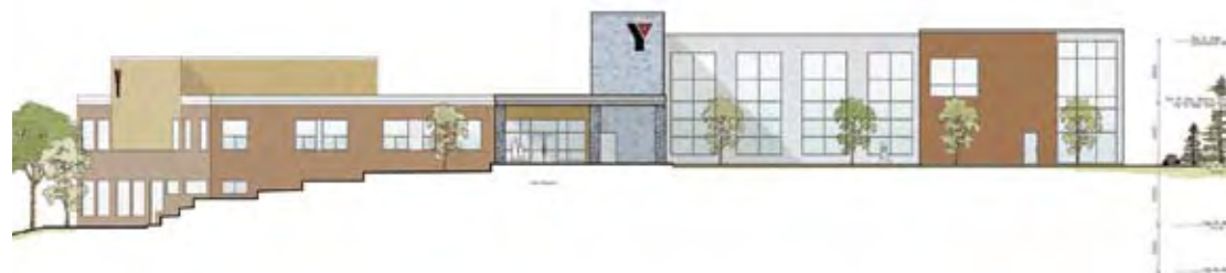
Artist's building concept - new St. John's Family Y