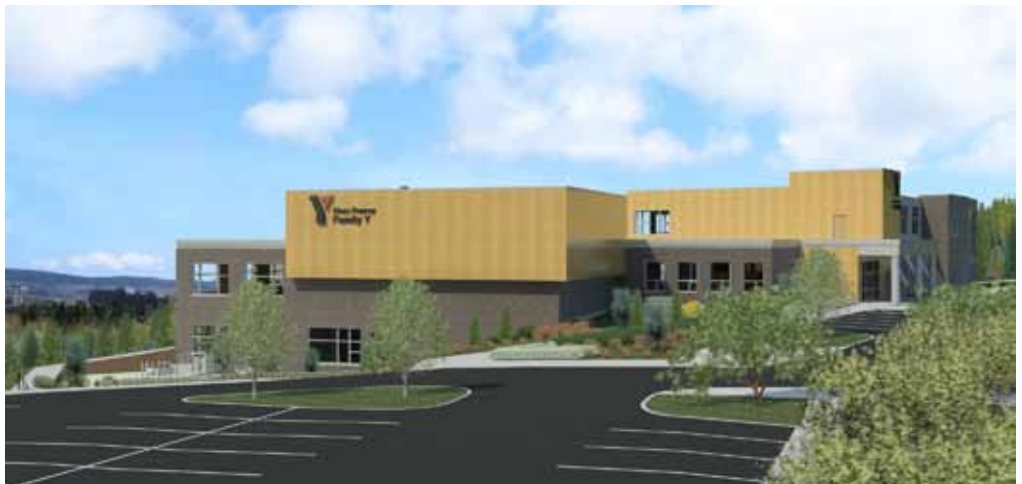
View From The Northeast