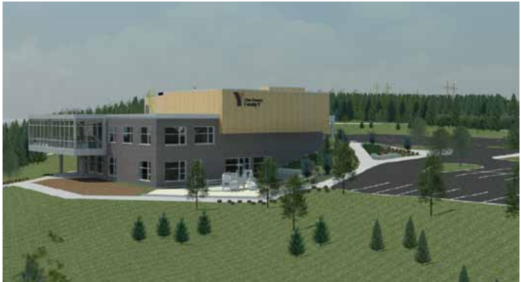
View From The East