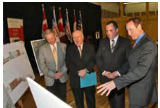
The YMCA-YWCA of Northeast Avalon will build a new multi-purpose, recreation, health, and family facility in St. John's.