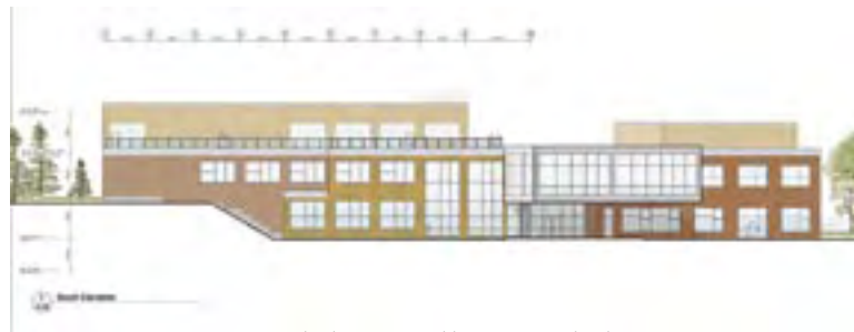
South Elevation - Building Concept Sketch