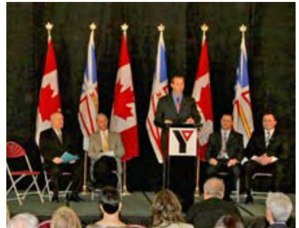
Honourable Peter MacKay, Minister of National Defense and Minister Responsible for the Atlantic Gateway announced Government Funding approval in December, 2008 for the new St. John's Family Y.

- Hon. Dave Denine, Minister of Intergovernmental Affairs.