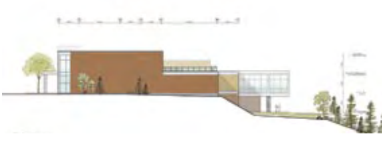
West Elevation - Building Concept Sketch