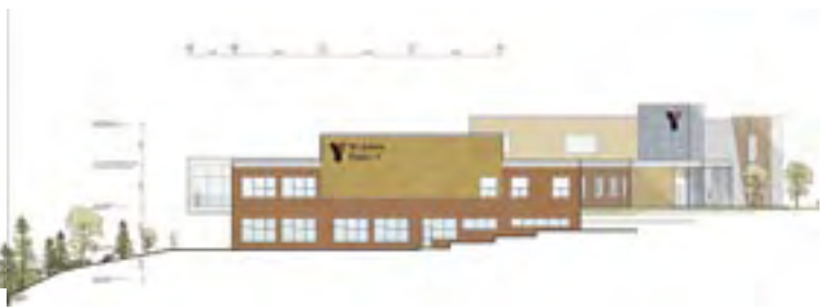
East Elevation - Building Concept Sketch