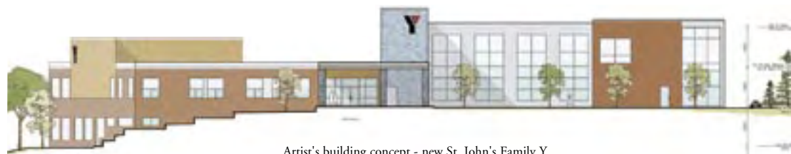
Artist's building concept - new St. John's Family Y